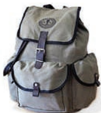
Cotton Canvas 1892 Retro Sierra Club Rucksack Sale Price: $16.12