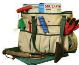
Utility/Garden Tool Bag Sale Price: $14.62