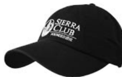
Organic Cotton Cap with Sierra Club Logo Sale Price: $9.75