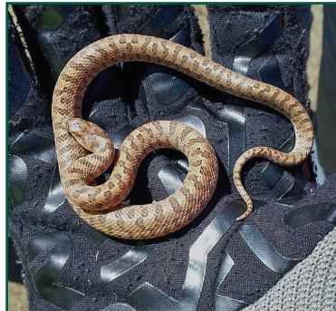
Glossy snake in El Monte Valley

biodiversity throughout recent history, data that simply do not exist in any detail whatsoever. Without such knowledge no one can make claims regarding the resilience of the region over time. Despite this the developers insist that the river valley