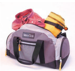
Camper Bag Sale Price: $13.12